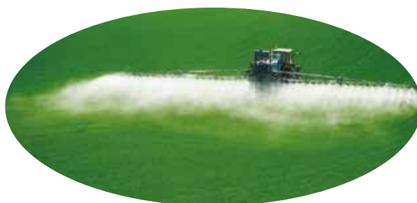
Field spraying of glyphosate

At the European level the European Commission was expected to authorize or not the glyphosate for the next ten years, by the end of 2015 (see below). The German Federal Institute for Risk Evaluation (Bundesinstitut für Risikobewertung or BfR) delivered in 2014 a report to the European Food Safety Authority (EFSA) that discarded any carcinogenic potential of the herbicide and even proposed to heighten by 60% the present threshold level of safety! The EFSA was expected to review the preliminary version of the BfR report and thereafter send a positive advice to the European Commission. The pronouncement of the CIRC/WHO has shattered all this procedure. In France the ministry of ecology has requested on 8 April 2015 the National Agency for the Sanitary Safety of Food, Environment and Work (ANSES, French acronym), to evaluate that pronouncement. An urgent decision was made to request four French experts to proceed immediately with an assessment of the divergent conclusions of the CIRC/WHO and of the German BfR. The latter has updated its reevaluation taking into account the conclusion of the CIRC and was expected to deliver it to the EFSA before the end of 2015. Regarding EFSA which has been often criticized for its positions showing some kind of conflicts of interest, it has tried to be fair by announcing it would consult with all the European safety agencies (authorities) before making a pronouncement (Foucart, 2015b).