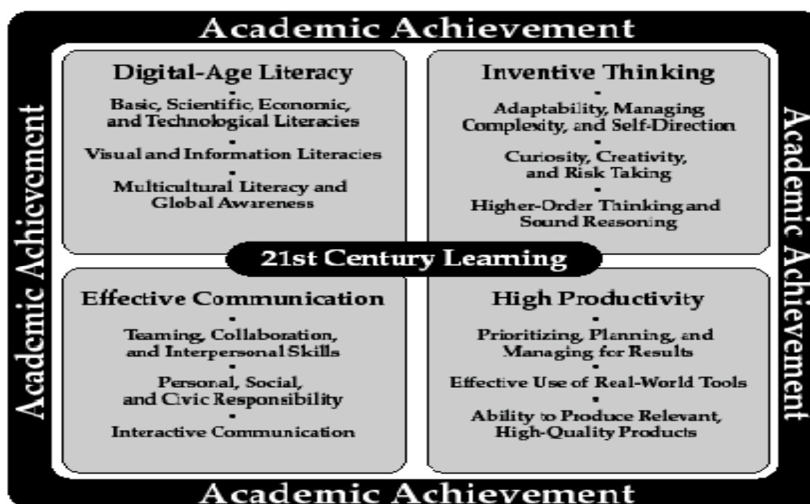
Figure 1 : The four Elements of the 21st Century Learning

The twenty first century bets strongly on the academic achievement, which targets fundamental and professional skills for students. Then, it is necessary to build a common understanding of what is leadership. Esmer & Dayi (2017) define leadership skills as “the ability to influence others and to be able to put into action for specific goals and targets” p.113. However, they define entrepreneurship as “a concept that is considered to be the driving power behind economic growth, economic development, employment and social welfare in recent years” (Ibid.). Therefore, both concepts go hand in hand to promote university students learning combining between digital skills, inventive thinking, effective communication and high productivity. (Figure 1)