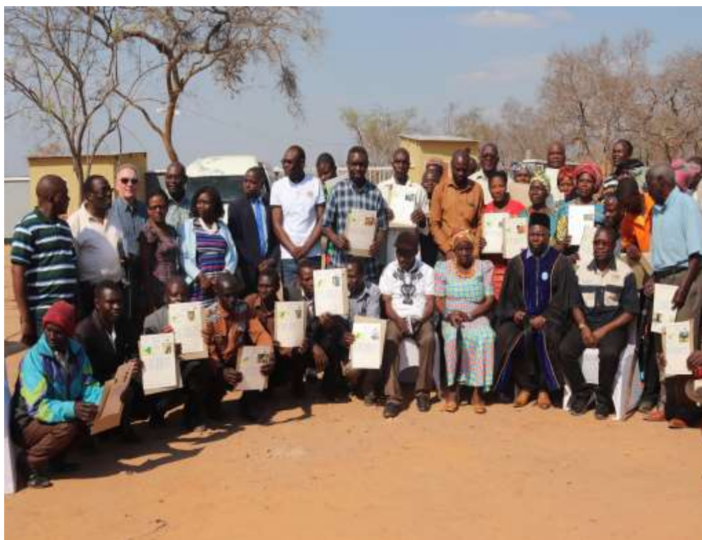
Photo 3: Beneficiaries of customary land certificates and stakeholders pose for a photo during the handover ceremony in September 2018

and 1,542 (43%) are men. The tenure documents have empowered the villagers and protected their interests on these lands, which they depend on for their basic livelihoods. The community is now able to negotiate with investors regarding the development of their land. For instance, in Bulemu village, seven families occupying a 103-hectare piece of land have negotiated a 25-year lease with an Israeli firm for a solar project. Using the certificates as proof of occupation. This agreement will see these households benefit from the solar energy at no cost for the next 25 years. Each household will further benefit from sharing in the earnings. Also, the local community will acquire skills on how to operate the solar.