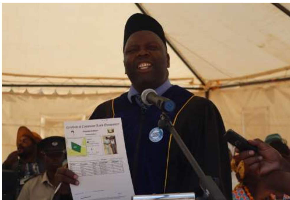
Photo 4: His Royal Highness Chief Chamuka VI displays a 'joint certificate' during the issuance ceremony in 2018

Another notable outcome is of the emergence of development planning guided by the spatial and social economic information that has empowered the community to engage relevant stakeholders. With the government implementing the decentralization policy, communities in Chamuka are well equipped with information necessary to drive their own development. The STDM process has provided invaluable information, profile and enumeration reports and spatial visualizations that are an empirical resource base to fully comprehend the developmental constraints and opportunities, which exist in the respective villages. Through this community led process, the residents can articulate their priorities and the course of interventions they would want to pursue. The digital databases created can be easily manipulated for updating the information pertaining to individual landowners and land parcels.