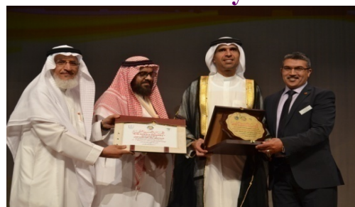
Arab Award in Chemistry-2013

The FIVE most published Authors in Corrosion + Inhibition on SCOPUS are: 1-Hammouti B. (424 papers); 2- Ouziichi M. A. (253); 3- Ebnou F. E. (224); 5- Zerrak A. (140); 4- Salaki B. (140); 12 Nov 15